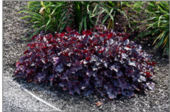
Plum Pudding Coral Bells

Plum Pudding Coral Bells will grow to be only 6 inches tall at maturity extending to 12 inches tall with the flowers, with a spread of 12 inches. When grown in masses or used as a bedding plant, individual plants should be spaced approximately 10 inches apart. Its foliage tends to remain low and dense right to the ground. It grows at a medium rate, and under ideal conditions can be expected to live for approximately 10 years. As an evergreen perennial, this plant will typically keep its form and foliage year-round.