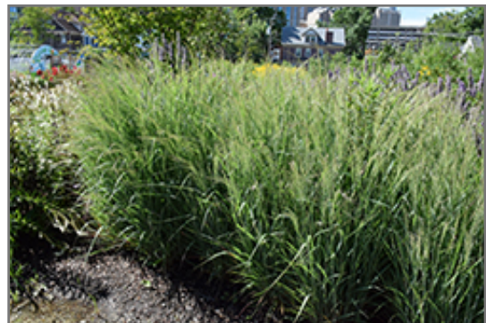
Prairie Winds Apache Rose Switch Grass