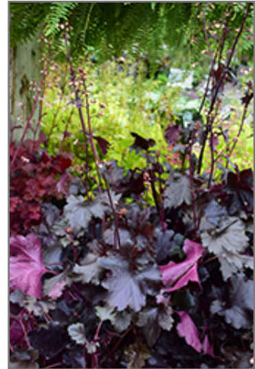
Black Pearl Coral Bells in bloom

Black Pearl Coral Bells is recommended for the following landscape applications;