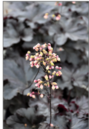
Black Pearl Coral Bells flowers