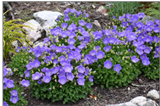
Rapido Blue Bellflower in bloom