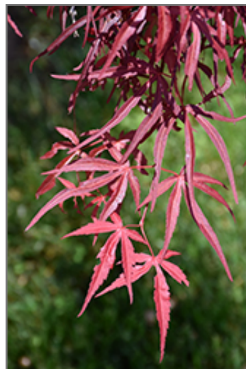
Red Spider Japanese Maple foliage