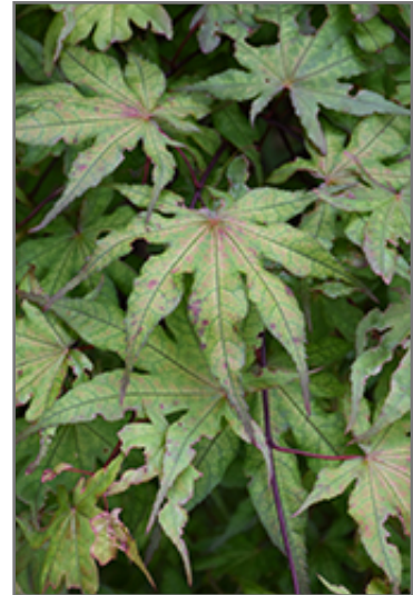
Amber Ghost Japanese Maple foliage