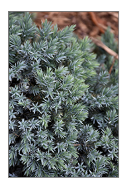
Blue Star Juniper foliage

777 Norfolk St N Simcoe, ON N3Y 3R6 p: 519-426-0711 w: ryersegardengallery.com