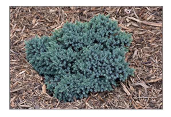
Blue Star Juniper