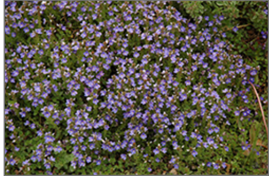
Turkish Speedwell in bloom

Turkish Speedwell is recommended for the following landscape applications;