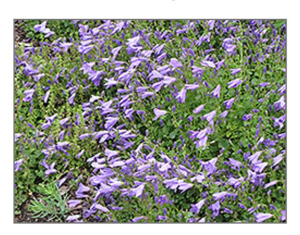
Birch Hybrid Bellflower in bloom