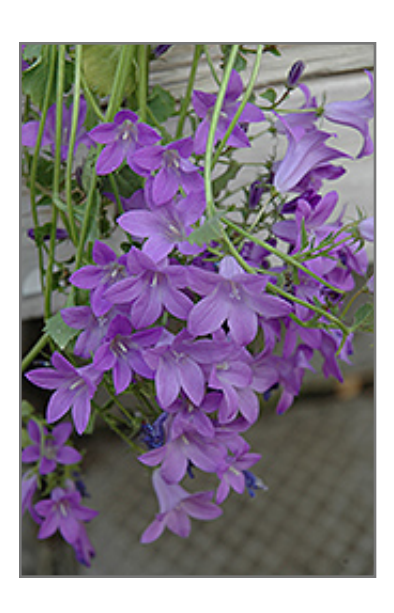
Birch Hybrid Bellflower flowers