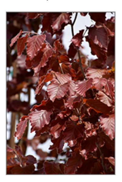
Red Obelisk Beech foliage