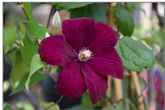
Rouge Cardinal Clematis flowers