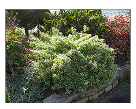
Emerald Gaiety Wintercreeper