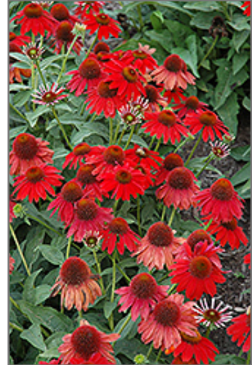
Sombrero Salsa Red Coneflower flowers

Sombrero Salsa Red Coneflower is recommended for the following landscape applications;