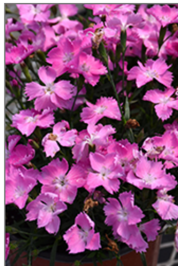
Beauties Kahori Pink Pinks flowers