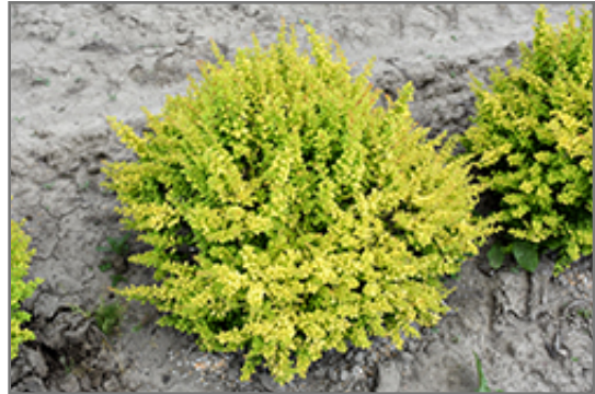
Sunsation Japanese Barberry

Sunsation Japanese Barberry is recommended for the following landscape applications;