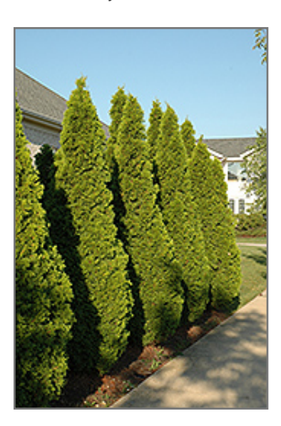
Emerald Green Arborvitae