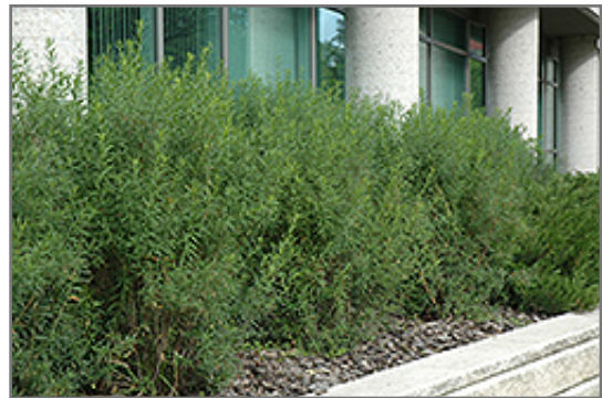
Dwarf Turkestan Burning Bush