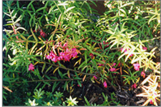
Dwarf Turkestan Burning Bush flowers

This shrub performs well in both full sun and full shade. It is very adaptable to both dry and moist locations, and should do just fine under typical garden conditions. It is not particular as to soil type or pH. It is highly tolerant of urban pollution and will even thrive in inner city environments. This is a selected variety of a species not originally from North America.