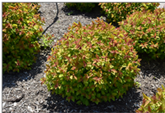
Double Play Big Bang Spirea