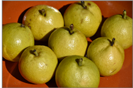
Golden Spice Pear fruit