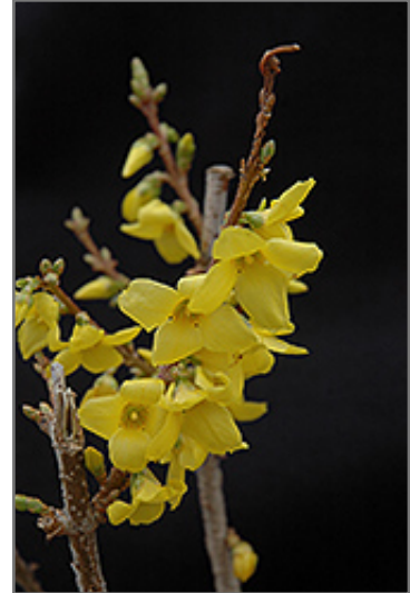
Show Off Forsythia flowers

Show Off Forsythia makes a fine choice for the outdoor landscape, but it is also well-suited for use in outdoor pots and containers. With its upright habit of growth, it is best suited for use as a 'thriller' in the 'spiller-thriller-filler' container combination; plant it near the center of the pot, surrounded by smaller plants and those that spill over the edges. It is even sizeable enough that it can be grown alone in a suitable container. Note that when grown in a container, it may not perform exactly as indicated on the tag - this is to be expected. Also note that when growing plants in outdoor containers and baskets, they may require more frequent waterings than they would in the yard or garden.